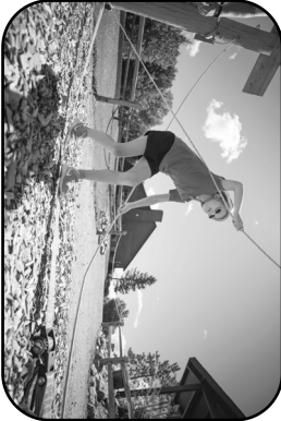
Kids Course, here we come!

With activities for all ages, you are sure to find a exhilarating experience at the Adventure Park! Feel the wind in your hair on the zipline, find your courage as you travel the Ropes Course, or let your littles burn off energy on the Kids Course.